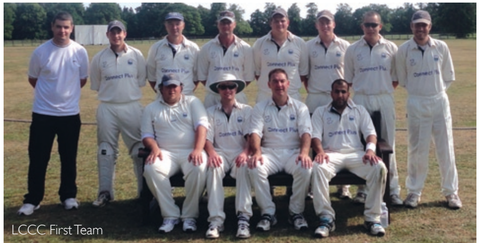
LCCC First Team