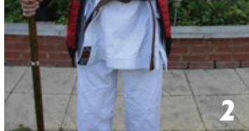
4 All the staff at Holly House