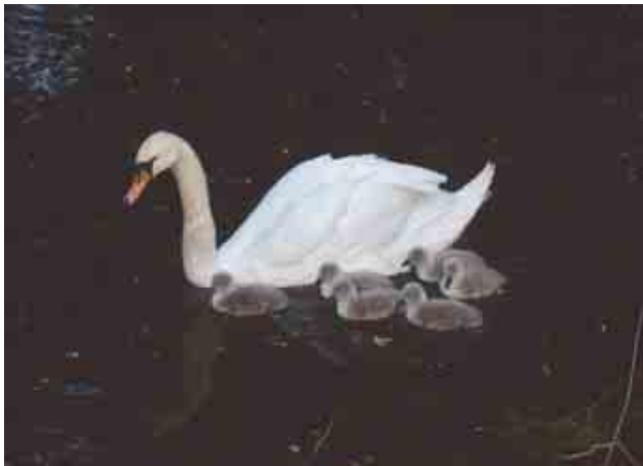
Swan and cygnets on the River Colne at London Colney in May