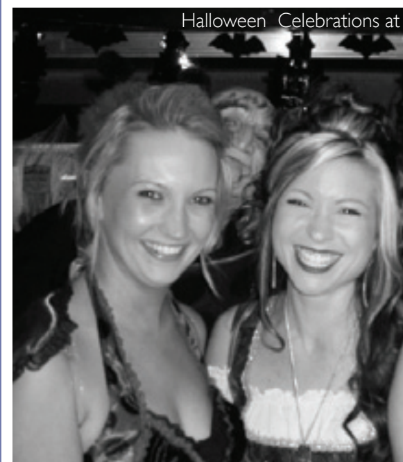
Halloween Celebrations at

For further details on all Youth Connexions activities, visit: www.channelmogo.org or www.mogozout.org