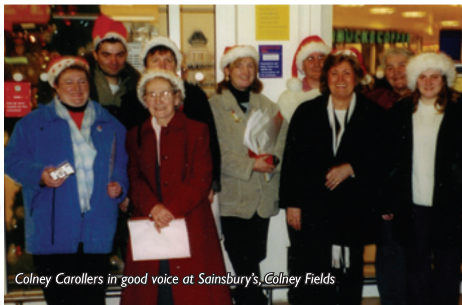
Colney Carollers in good voice at Sainsbury's, Colney Fields